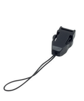
Mobile holder (15mm, 20mm)