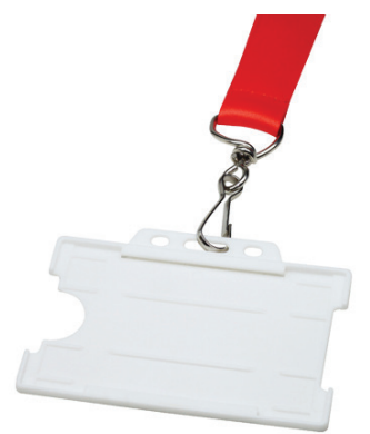
Passholder hard (vertical, horizontal: 90x60mm)