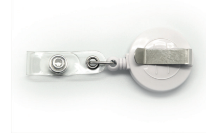
Pull reel passholder