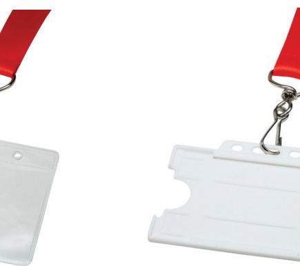
(vertical: 90x60mm, 145x95mm, Horizontal: 90x60mm)