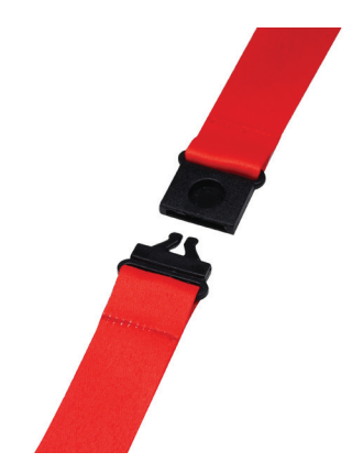
Safety breakaway attachment (15 mm, 20 mm, 25 mm)