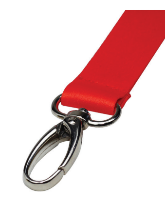
Premium carabiner (20 mm, 25 mm)