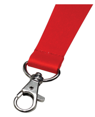
Standard metal carabiner (15 mm, 20 mm, 25 mm)